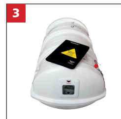
3 Record result in log book. Done!

VIKING S30s are serviced using a combination of annual onboard inspections carried out by crew and specialized service after 30 months at a VIKING certified service station.