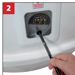
2 Insert testing tool and hold for 5 seconds