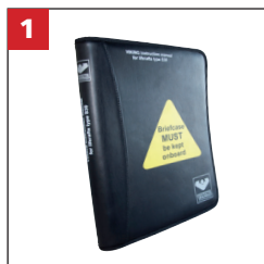
1 Register date and serial number in log book

Just 3 easy steps is all it takes for the crew to perform annual onboard inspections.